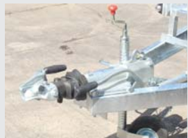
High quality Bradley™ hitch