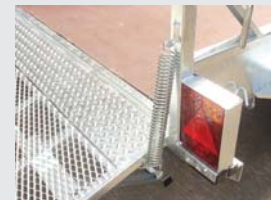
Spring loading door