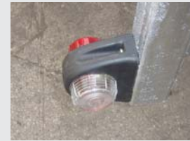
Additional lighting for increased safety