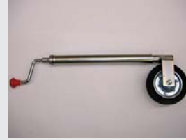
Jockey Wheels & Stands