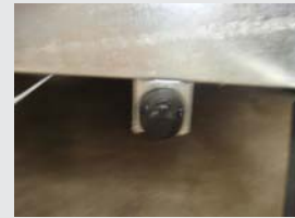
Detachable cable at both ends