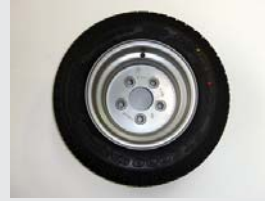
Wheels & Tyres

We also stock Winches, Compensators, Bungs, Door Supports, Clamps, Cables and Springs