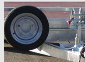
Spare wheel mounted in a convenient area