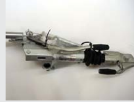
Hitches / Couplings

We have a full range of parts and accessories which are generally in-stock and available for purchase direct from us, please contact us for prices and availability.