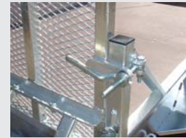
Extra secure locking and fixtures